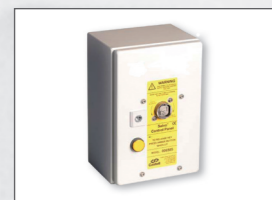
Salvo Control Panel (SCP)