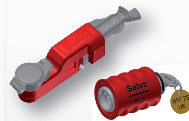
Salvo SGL and Susie