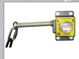
Salvo Manual Door Lock (SMDL)