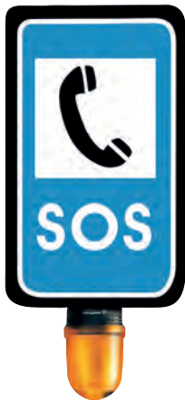
Clear identification of escape routes can save lives