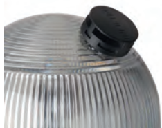
A special valve in the lens also prevents the build-up of condensation inside the beacon