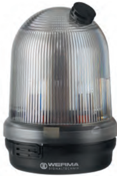
Modified flashing beacon 828 specifically for use in road tunnels