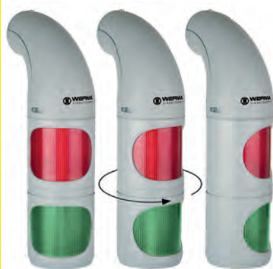
The direction of the optical signal can be individually adjusted