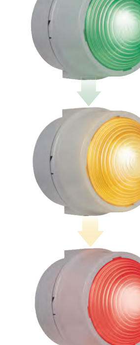
3 colours in one beacon: green, yellow, red