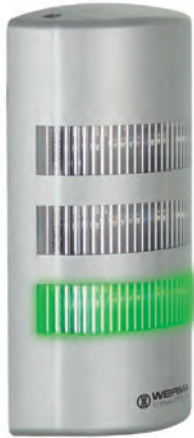
FlatSIGN in metallic finish

In its inactive state, the signal tower blends into the background thanks to its colourless, translucent housing