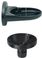
Plastic bracket, adaptor for tube mounting (accessories)