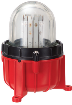
LED Obstruction Light Type B