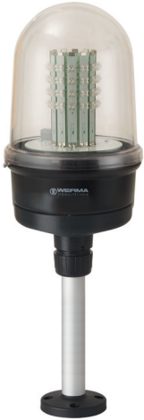
LED Obstruction Light Type A - The adaptor (accessory) allows quick and simple mounting on a tube