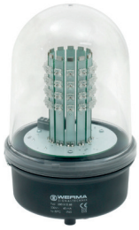
LED Obstruction Light Type B