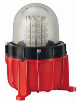
LED Obstruction Light Type A