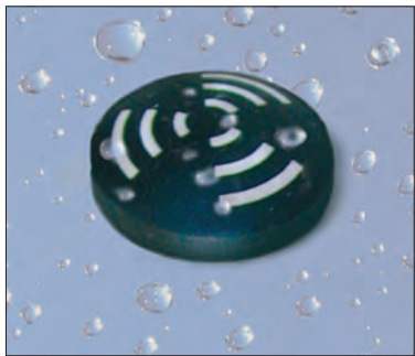
High protection rating IP 65 for use in arduous conditions