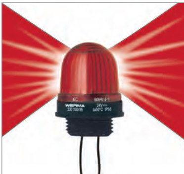
Mainly sideways illumination