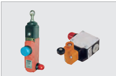
The LED Installation Beacon 230 can for example be used in applications with cable-operated switches or limit switch devices