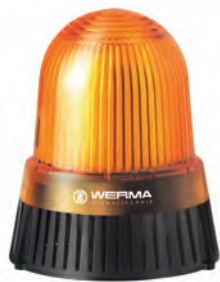
LED Permanent Light in combination with Multi-Tone Sounder