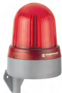
Quick and simple wall mounting without additional accessories thanks to integrated mounting bracket (432)