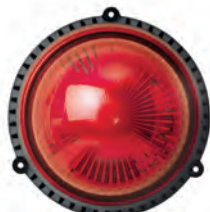
Mounting holes integrated into the product rim allow easy mounting without having to remove the lens (430)