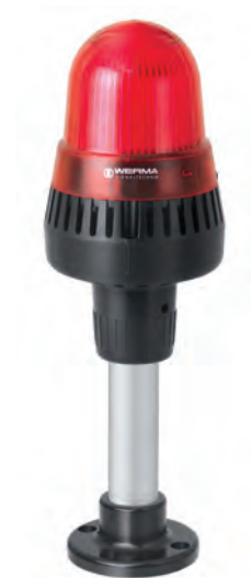
The adaptor enables mounting on a tube (431)