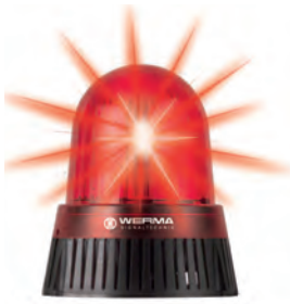
Multi-functional LED beacon: 3 light effects can be externally triggered