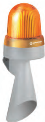
Multi-functional LED beacon: 3 light effects can be triggered externally