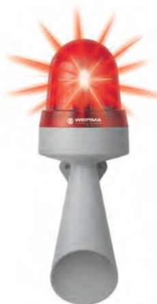
The "EVS" light effect ensures a maximum attention-grabbing effect