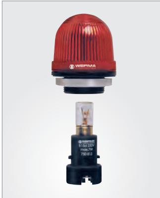
Bulb change via rear access with bayonet holder