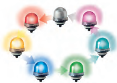
7 colours in one beacon: red, yellow, green, white, blue, violet and turquoise