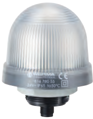
816 Multicolour with opaque lens