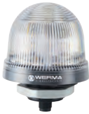
816 Multicolour with clear lens